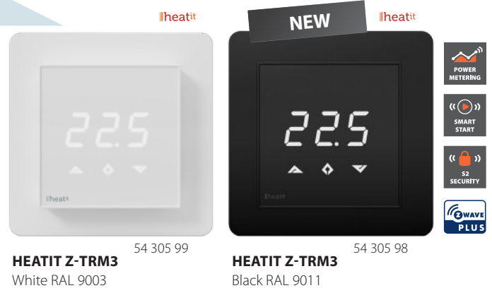
HEATIT Z-TRM3 White RAL 9003