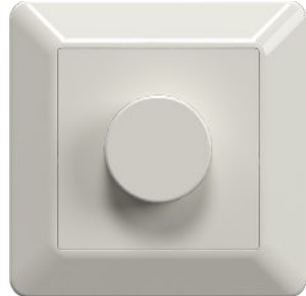
White RAL 9010