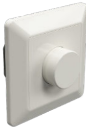
1x White RAL 9010 plastic kit