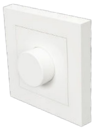
1x White RAL 9003 plastic kit