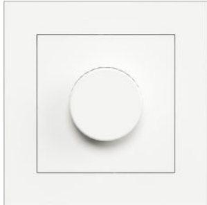
White RAL 9003